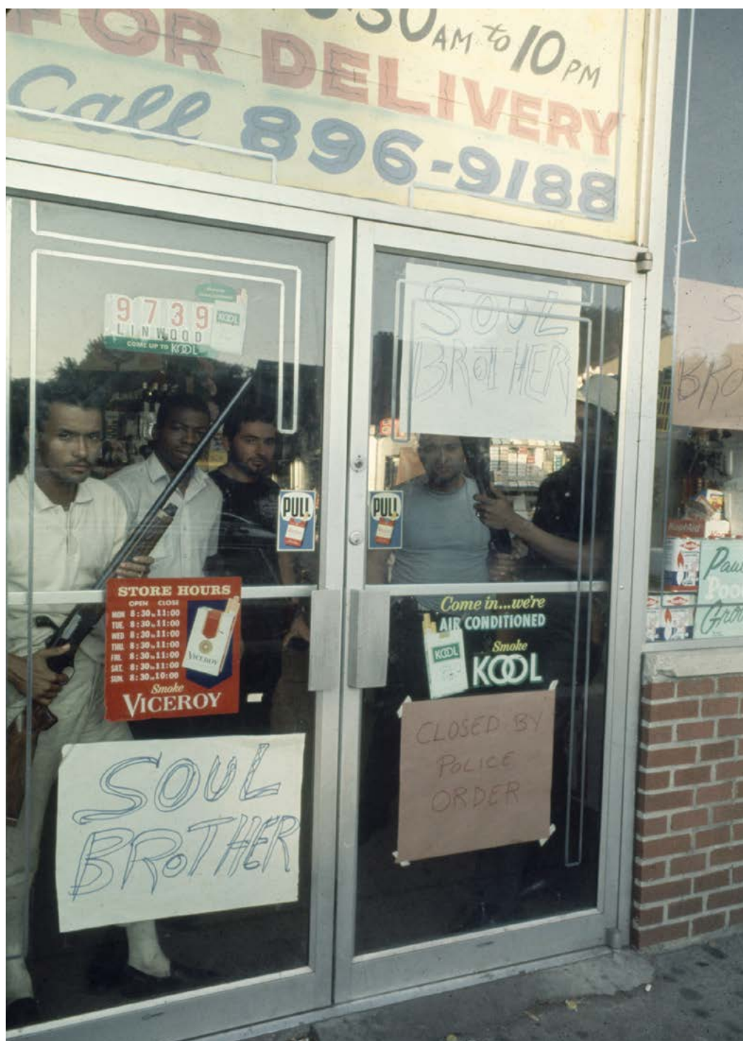
African American store owners protecting their store in the aftermath of the Detroit riots of 1967.